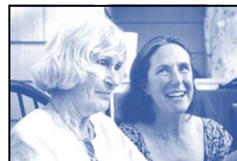
If you are 18 years or older and want to direct what should happen to you in the event you become incapacitated, then enact a Living Will.

The Durable Power of Attorney for Health Care is a document that allows patients to specify in advance